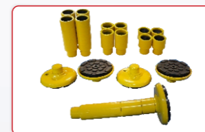
The stackable rubber pads package with 1.5", 2.5", 5" extension adapters.