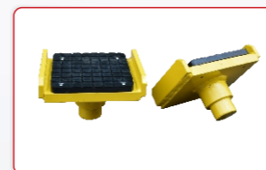
Optional saddle adapter. Kits No.:21103 (heavy-duty truck)

The chain protection cover prevents the chain from slipping off.