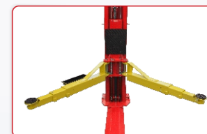
4 three-stage arms are suitable for more vehicles.