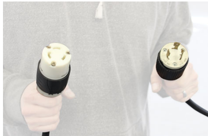
Male/Female Plug Combination