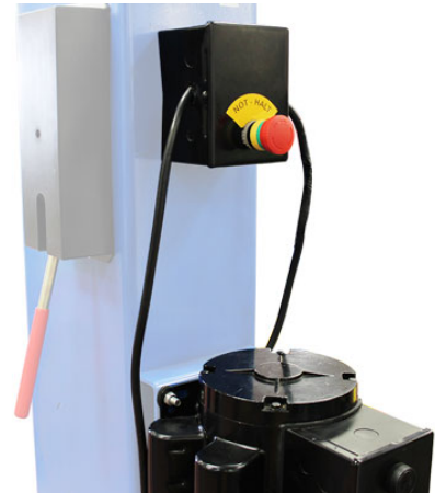
Quick Disconnect Box

If the electric switch would become compromised and the power supply to the lift needed to be disconnected immediately, a quick disconnect box or a male/female electrical plug combination will allow the operator to disconnect the power from the lift.