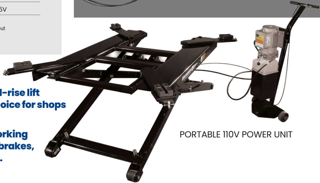
PORTABLE 110V POWER UNIT

The 6000MRL mid-rise lift is an excellent choice for shops with low ceilings.