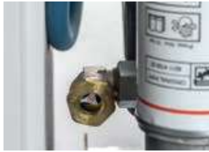
Oil level check