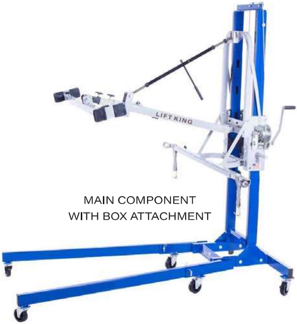
MAIN COMPONENT WITH BOX ATTACHMENT