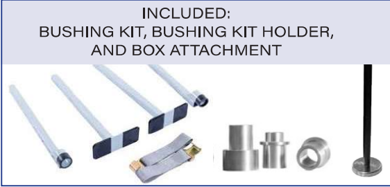
INCLUDED: BUSHING KIT, BUSHING KIT HOLDER, AND BOX ATTACHMENT

The Lift King Light Duty Works Package comes with everything needed for one technician to remove or install OEM pickup boxes of all sizes, including 8' dually boxes. It also comes with other attachments, to remove bumpers, hitches, automotive hoods, and automotive, sprinter, and semi cab doors. This package also includes a Stabilizer Kit which eliminates most of the front-end bounce of the box,