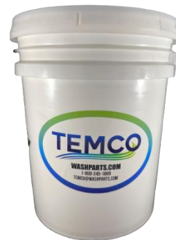
HIGHLY CONCENTRATED AP BLEND DETERGENT

800-245-1869 | temco@washparts.com | www.washparts.com