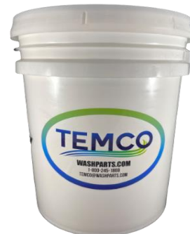
HIGHLY CONCENTRATED AP BLEND DETERGENT

800-245-1869 | temco@washparts.com | www.washparts.com